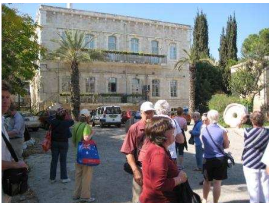
Bridges for Peace Headquarters in Jerusalem