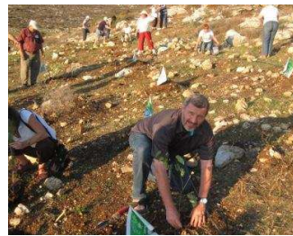
Tree-planting in Lavi Forest at Golan Junction in the Galilee

Philistines on the hills near Beit Shemesh; and gathering "five smooth stones" from the brook where David found his. Being on the top of Mount Carmel and looking down on the valley of Megiddo - knowing what will come there I cannot describe my