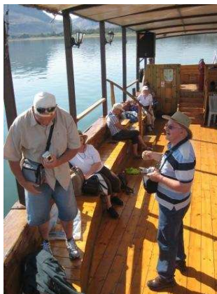
Lake Galilee boat ride