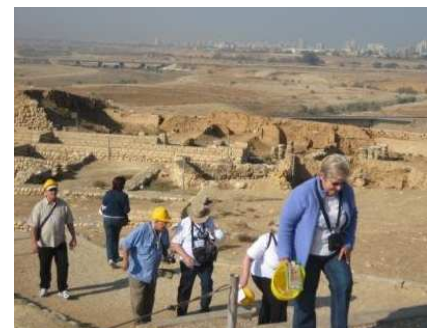
At Tel Be'er-sheva - modern city in the background