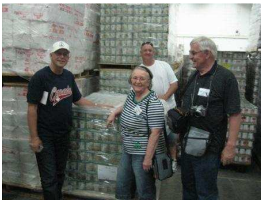
Evidence in Karmiel in the north of BFP's Matthew 25 ministry

I found the tour very educational, from the death camp which contrasted with the beautiful village nearby, the history of Poland, the culture of Poland which surprised me - it's a very rich and beautiful country.