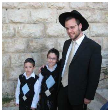
Jewish father and sons on Shabbat evening

My impressions and the impact I have gained of Israel are simple. I have found that the people love their country and will look after it and defend it.