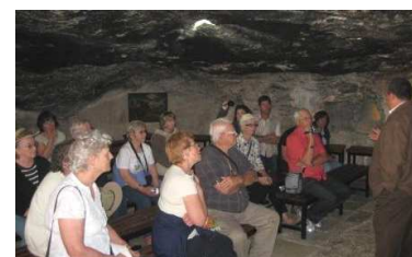
In one of the Bethlehem shepherds' caves