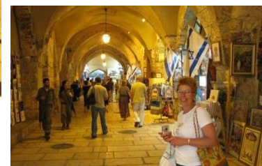
Shopping in the Jerusalem Cardo