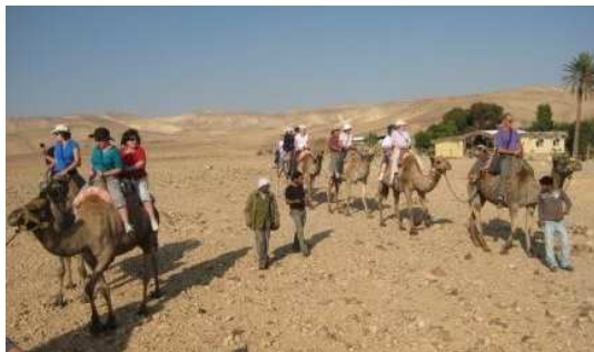
A camel ride in the desert to really wake you up!

And now some final pictures - just in case you need a little more encouragement to join us on our next tour in October-November 2009