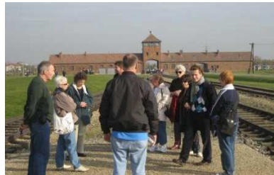
At Birkenau extermination camp