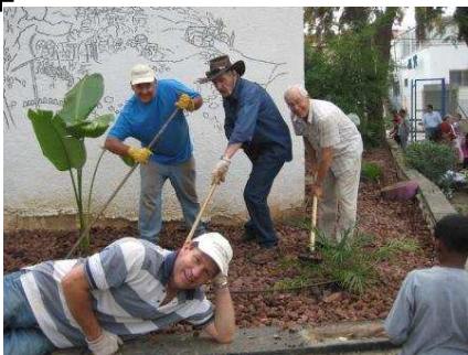
Men at work at the Adayahu School in Beit Shemesh