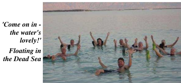
'Come on in - the water's lovely!' Floating in the Dead Sea