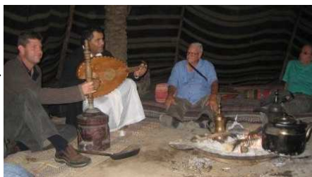
Bedouin entertainment in a tent in the Negev desert