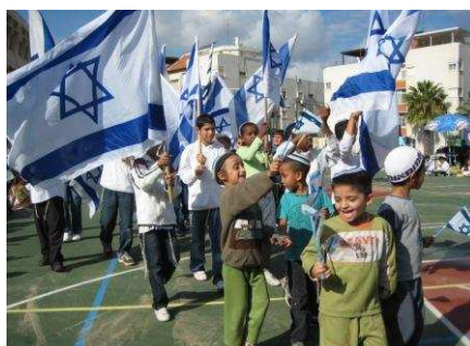
Flags fly as schoolkids say goodbye to our tour group